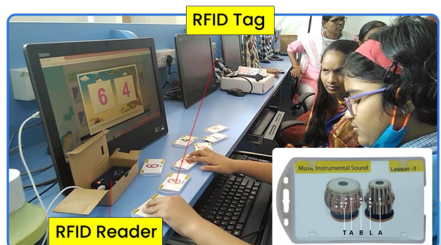
Computer with an RFID Card/Reader interface

In "Knowledge Vision" platform, Divyang children can directly interact with Computer thru an RFID Card/Reader interface for both learning and assessment. For Visually Impaired children, Braille characters are embossed on the RFID tags to identify the tags for interacting with the Computer.