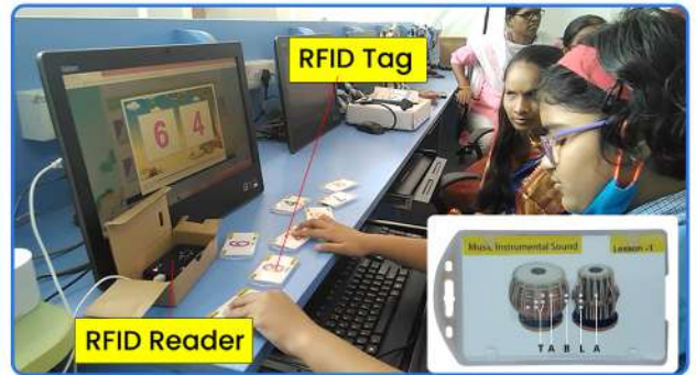
Computer with an RFID Card/Reader interface

SDF approach of using technology to change the teaching pedagogy for divyang children from typical flash card to an interactive way.